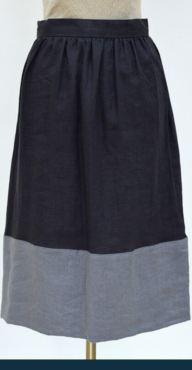
Available in colours: grey and blue