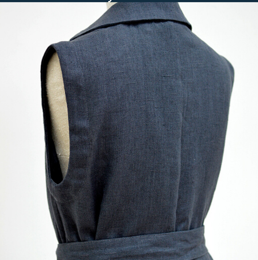
Sizes available: 36-54

The vest comes in a heavy-weight linen, which is suitable for all-season clothing. Decorative stitching and spacious pockets make this vest timeless and suitable for numerous occasions. This piece is one of the wardrobe items you will reach for to create various looks throughout the year.