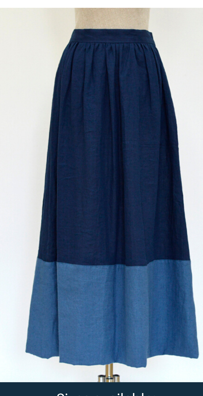
Sizes available: 36-46