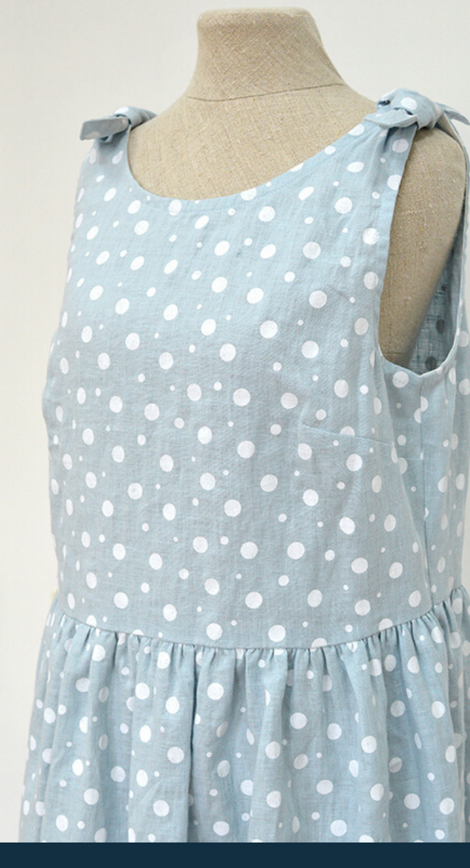
Sizes available: 36-50

Available in colours: beige and light blue