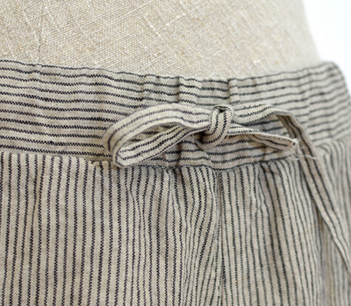
Available in colours: beige and grey

Pop from home to party with no fuss in this pair of versatile linen trousers. Self-tie waistband that is comfortable and easy to pull on, the fine pinstripe design makes them smart. The medium-rise waist and loose, wide-leg fit gives a relaxed edge that can be dressed up in an instant with any shoes of your choice.