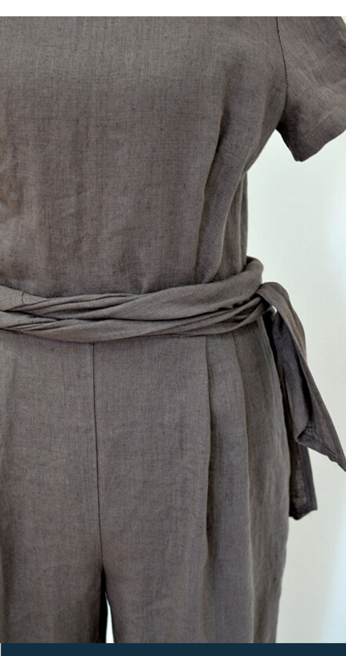
Sizes available: 36-52