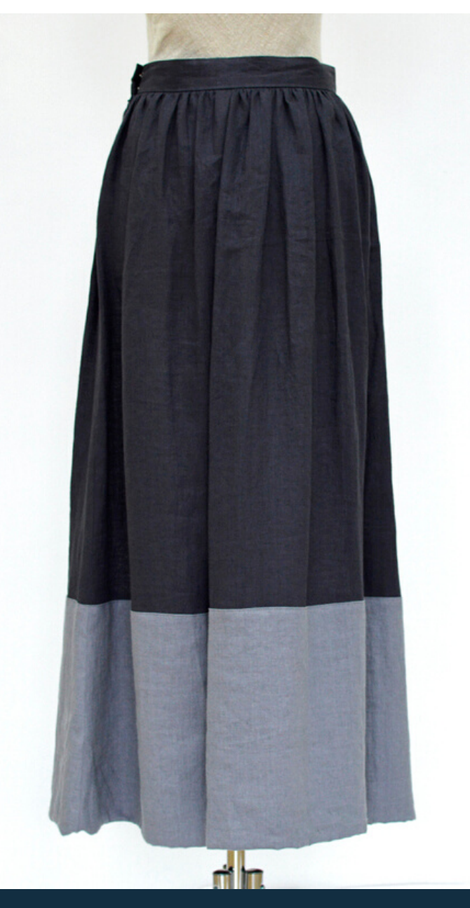
Available in colours: grey and blue

Long skirt with side pockets. This skirt features zipper at the side and higher waist for full comfort.